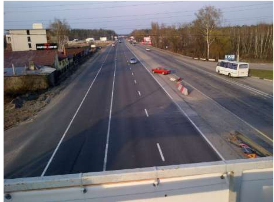
Left turns and U-turns on motorways