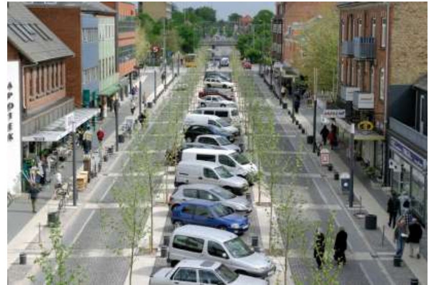
Safe integration of all road users