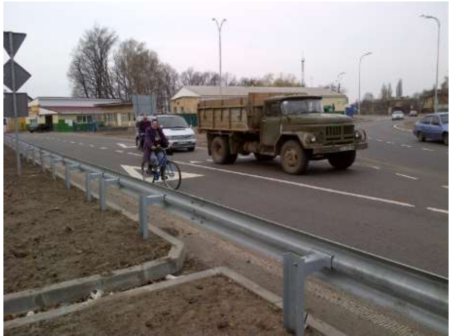
Unsafe design of roundabouts