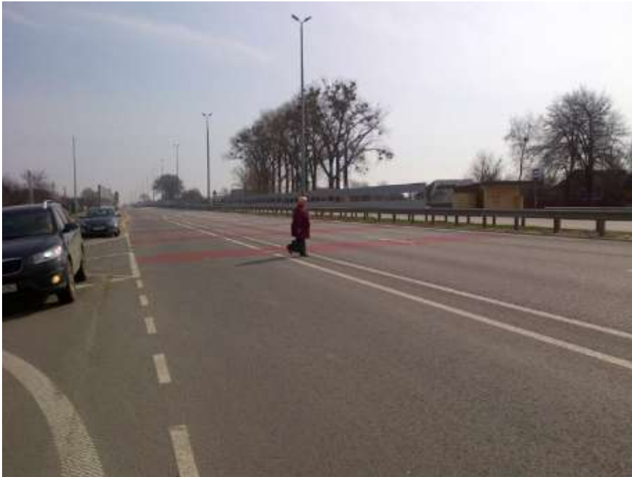
Lack of facilities for vulnerable road users

What happens if we don't pay attention to road safety in planning, design and construction?