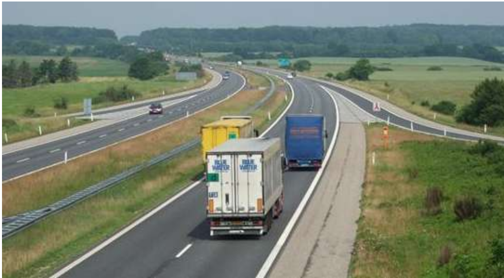
Effective separation of road users