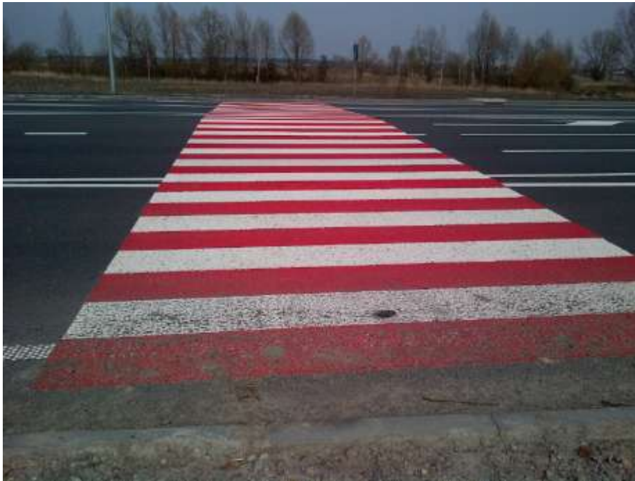
Zebra crossings on motorways

What happens if we don't pay attention to road safety in planning, design and construction?